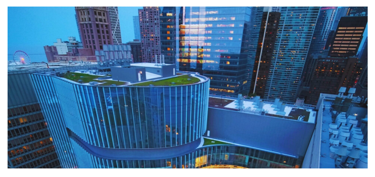
NORTHWESTERN UNIVERSITY | DEPARTMENT OF RADIOLOGY